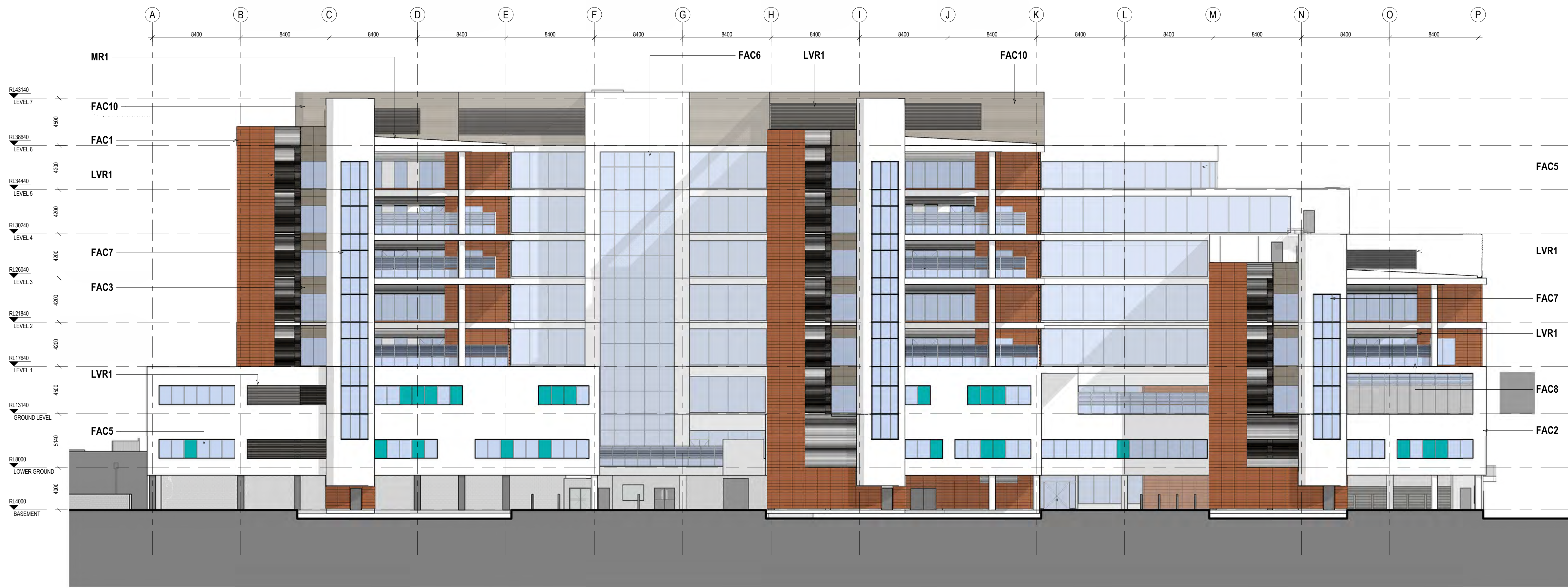
2 SOUTH ELEVATION 15B2 1:200

NOTES: TO BE READ IN CONJUNCTION WITH SERVICES, STRUCTURAL & CIVIL DOCUMENTATION. ANY DISCREPANCY TO BE BROUGHT TO THE ATTENTION OF JACOBS.