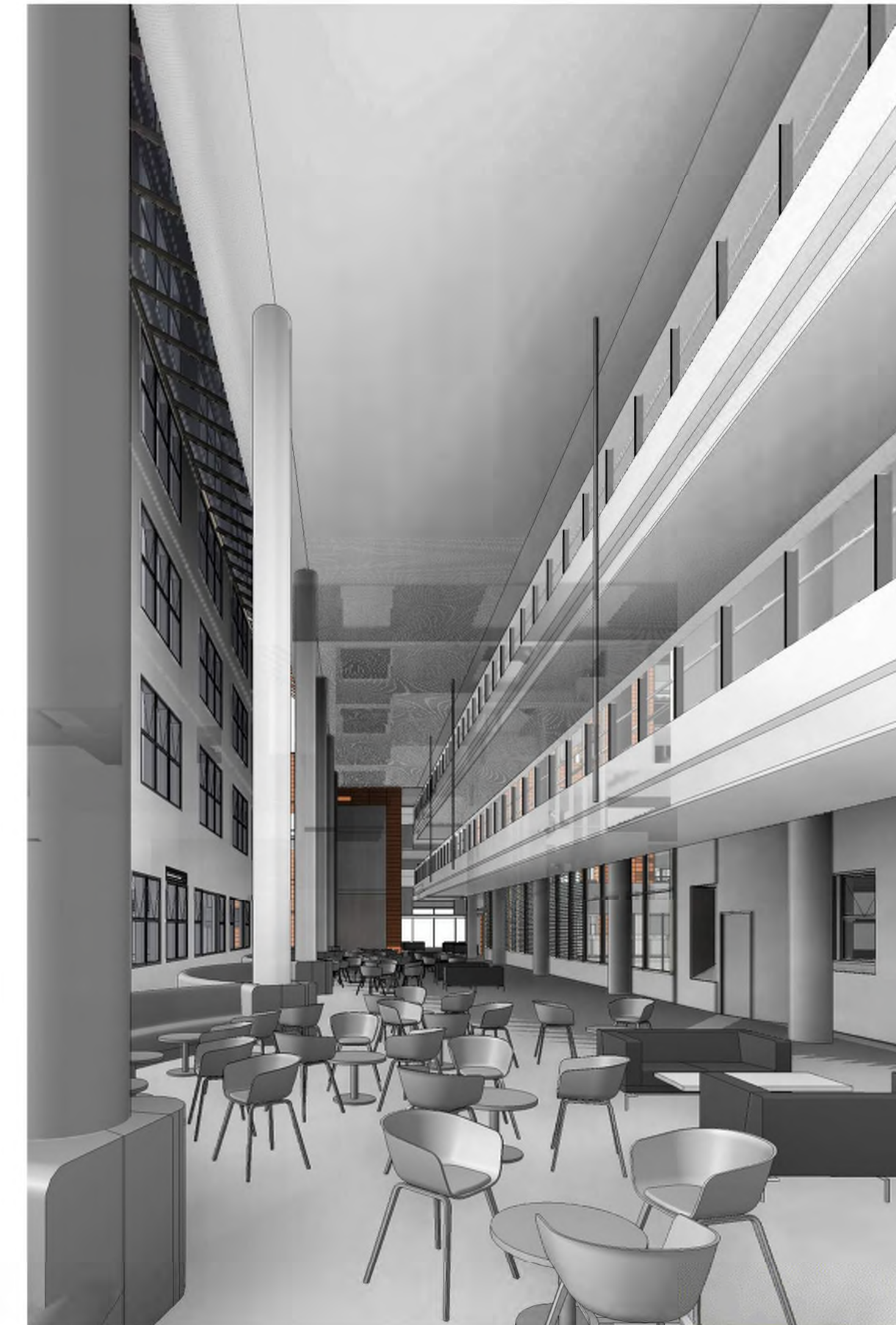
3 ATRIUM VIEW LOOKING SOUTH