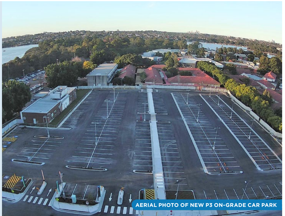
AERIAL PHOTO OF NEW P3 ON-GRADE CAR PARK